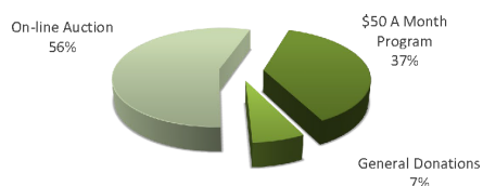
Contributions for Y/E 2022